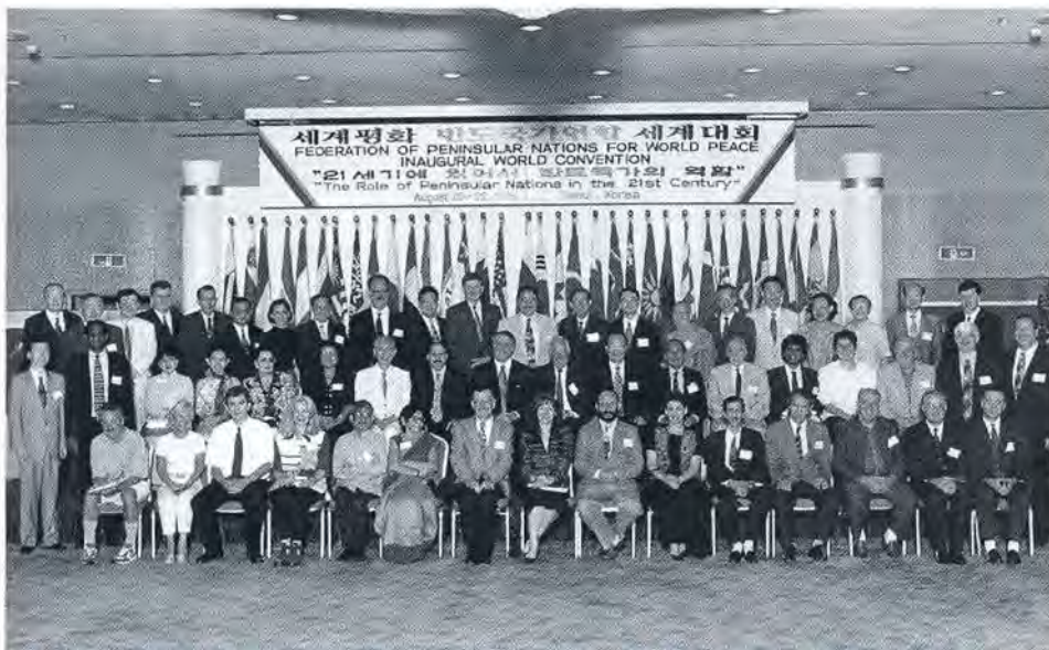
Participants of the Inaugural World Convention of the Federation of Peninsular Nations for World Peace.

And why? Because of racism, ethnic hatreds, religious bigotry, anti-Semi-