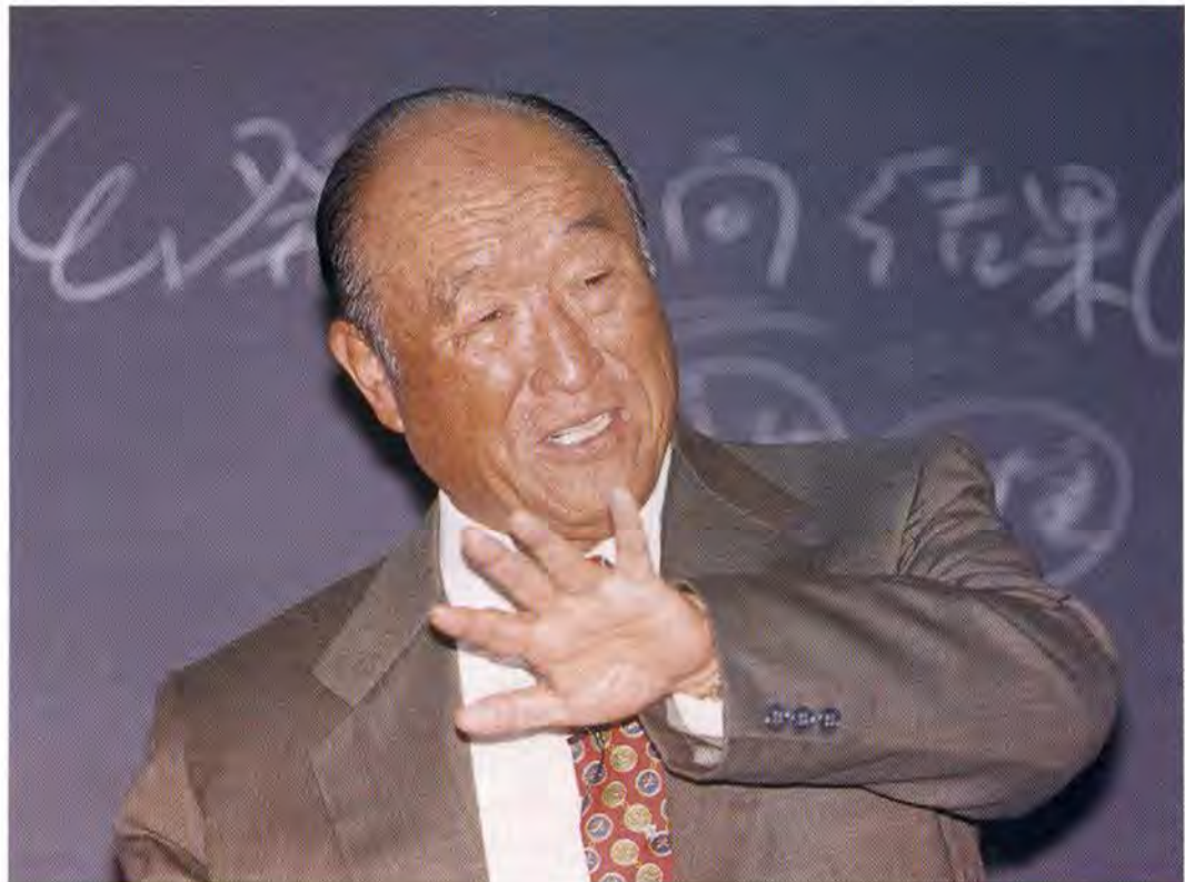
Father addresses New York area members at Sunday Service, June 9, 1996.

The Pilgrims came to North America because of their faith and their religious beliefs. However, the founding fathers who went to South America went for wealth and treasure. This basic difference in purpose and direction existed. Fortunately, the Pilgrim Fathers came because they desired to worship God