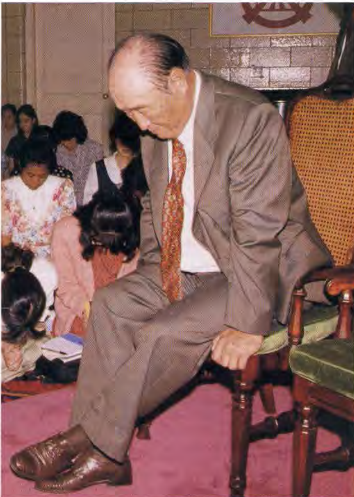
Father joins the closing prayer following the speech at Belvedere.

God is the seed of your parents, tribe, nation, world and