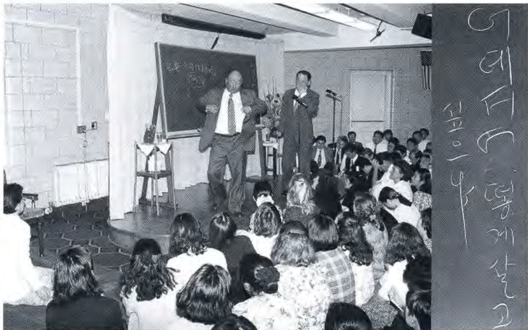
Father explains about true love as the point of origin. (Right) The title of the speech in Korean.

Our sexual organ has the desire to conquer the king of kings of the universe. The husband stands in the position of king, and God is in the position of king of kings. This is the palace of true love, life and lineage. Without this organ we are not able to create the ideal world. The secular world has considered the sexual organ to be the worst possible thing, because through this sexual organ all humanity was destroyed. That is why God desired people to be chaste and follow an ascetic path through the various religions. Grandparents, parents, husband and wife all hang onto the sexual organ of their spouse. That is why there is equality. If this balance is broken, the entire