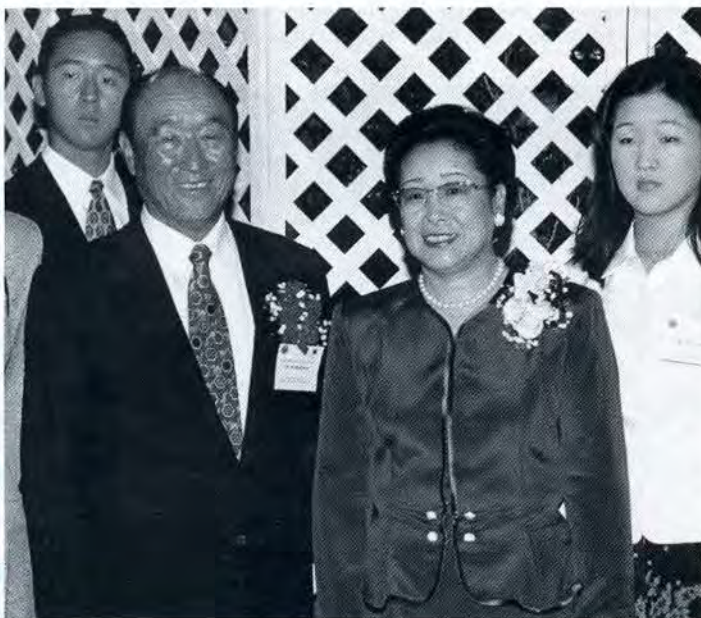
Front Cover: True Family poses for a picture at the Inauguration of the Family Federation for World Peace, Washington D.C., August 1, 1996.