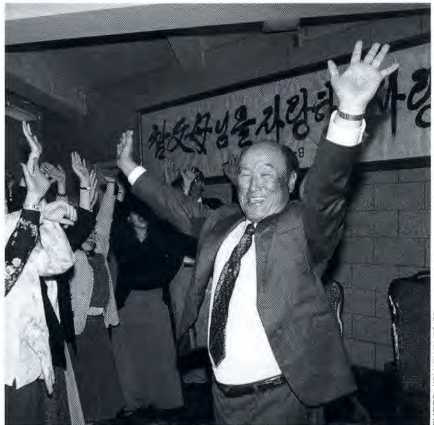
Father leads an enthusiastic cheer of "mansei."