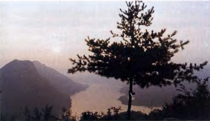
The 'Tree of Blessing' at Chung Pyung Lake.