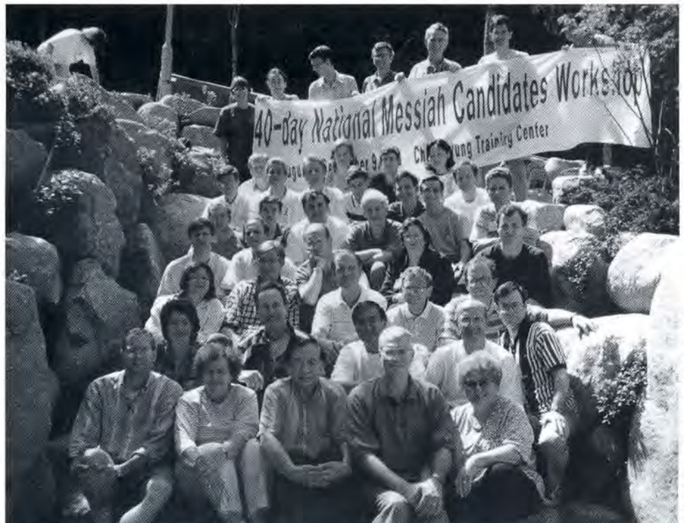
Some of the participants of the 40 Day Training pose for a group picture.