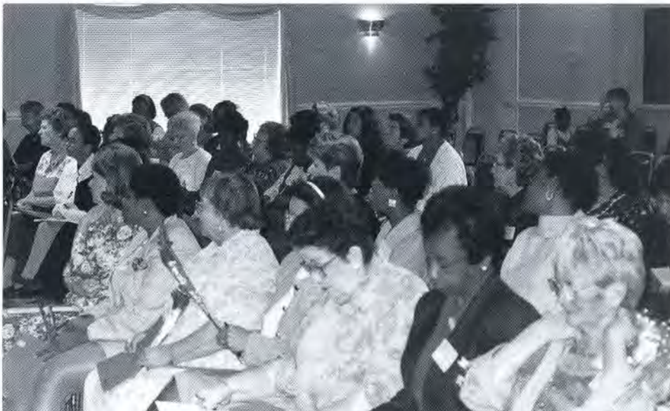
Participants review program booklets during orientation, Tampa, Florida. April 13, 1996.