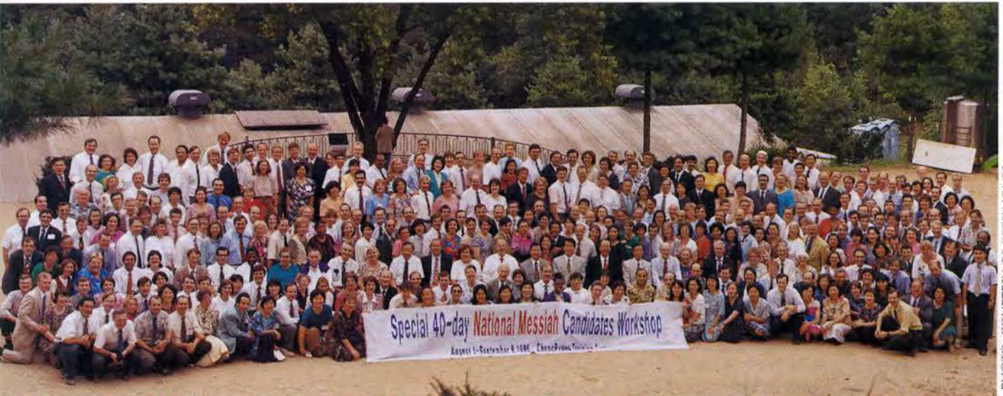
Participants in the 40-day National Messiah Candidates Workshop at Chung Pyung Lake, August 1 - September 9, 1996.