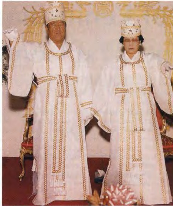
True Parents' Day prayer, April 18, 1996.