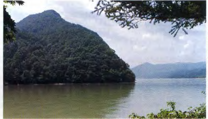
A view of Chung Pyung Lake [the restored Garden of Eden].